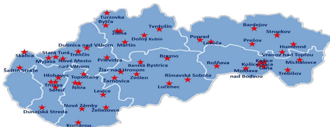
Map of 49 pilot schools